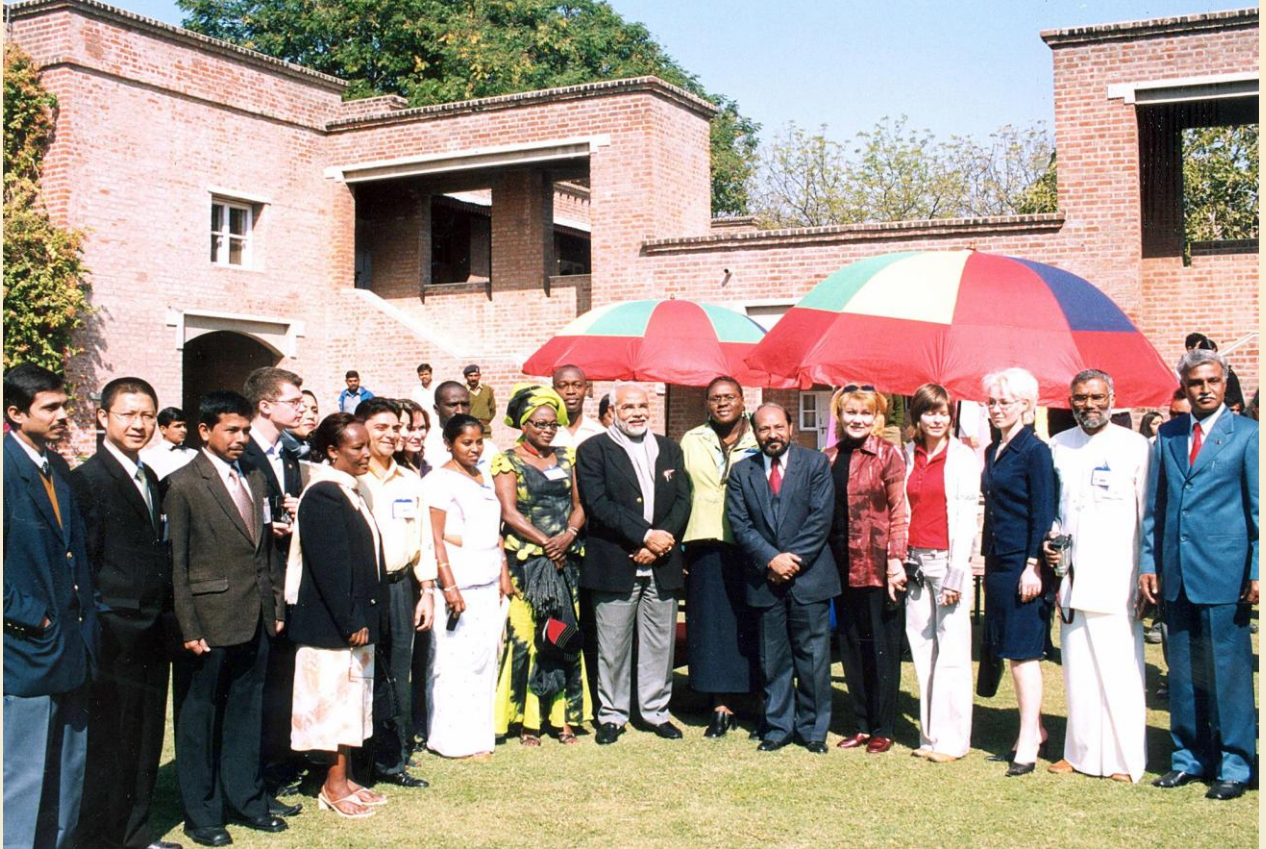
2005-06 ITEC participants with Shri Narendra Modi, the then Chief Minister of Gujarat, and the current Prime Minister of India

Flavour Development Centre), WTO related topics (Centre for WTO Studies, Indian Institute of Foreign Trade), etc. Also, some innovative courses are offered under ITEC, including one on solar technology for semi-literate and illiterate grand mothers from the Least Developed Countries at Barefoot College, Tilonia .