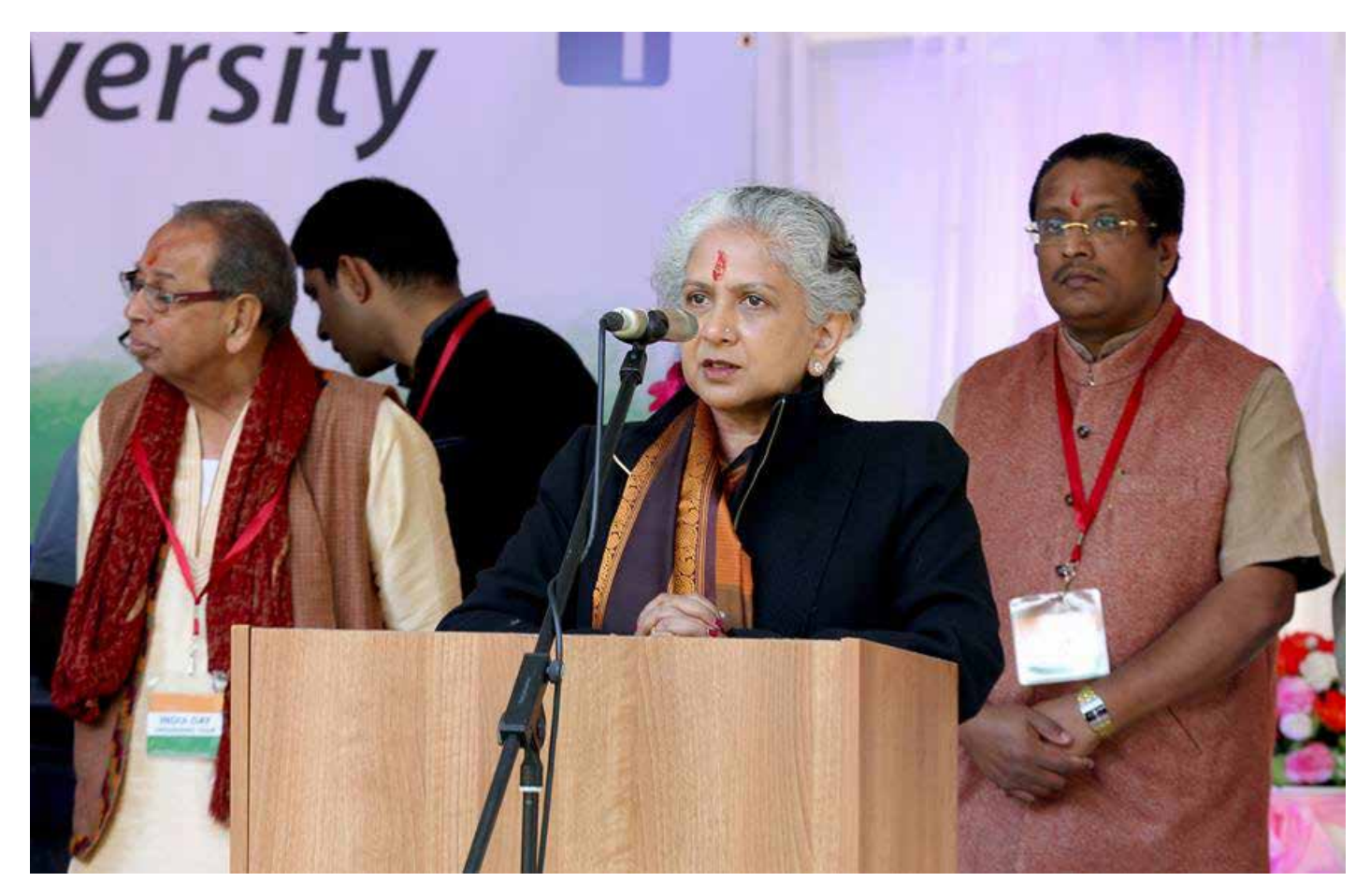
Ambassador addressing during the India Day event.