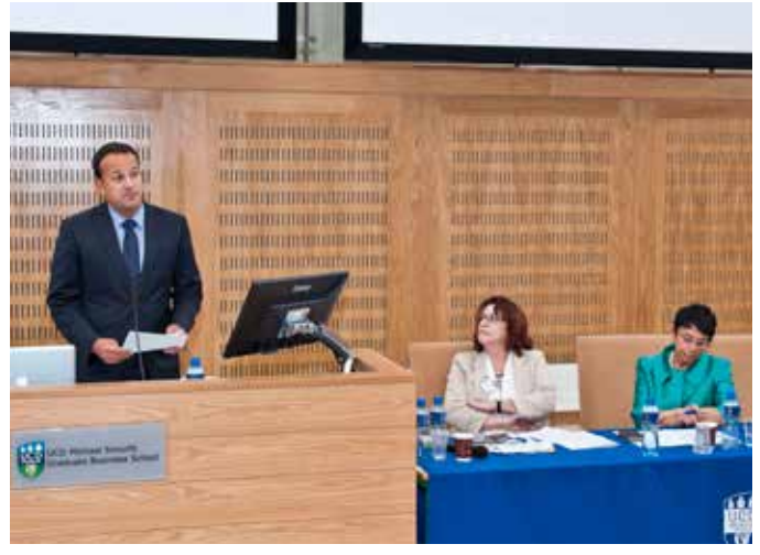
H.E. Mr. Leo Varadkar, Minister for Health speaking during the Conference.