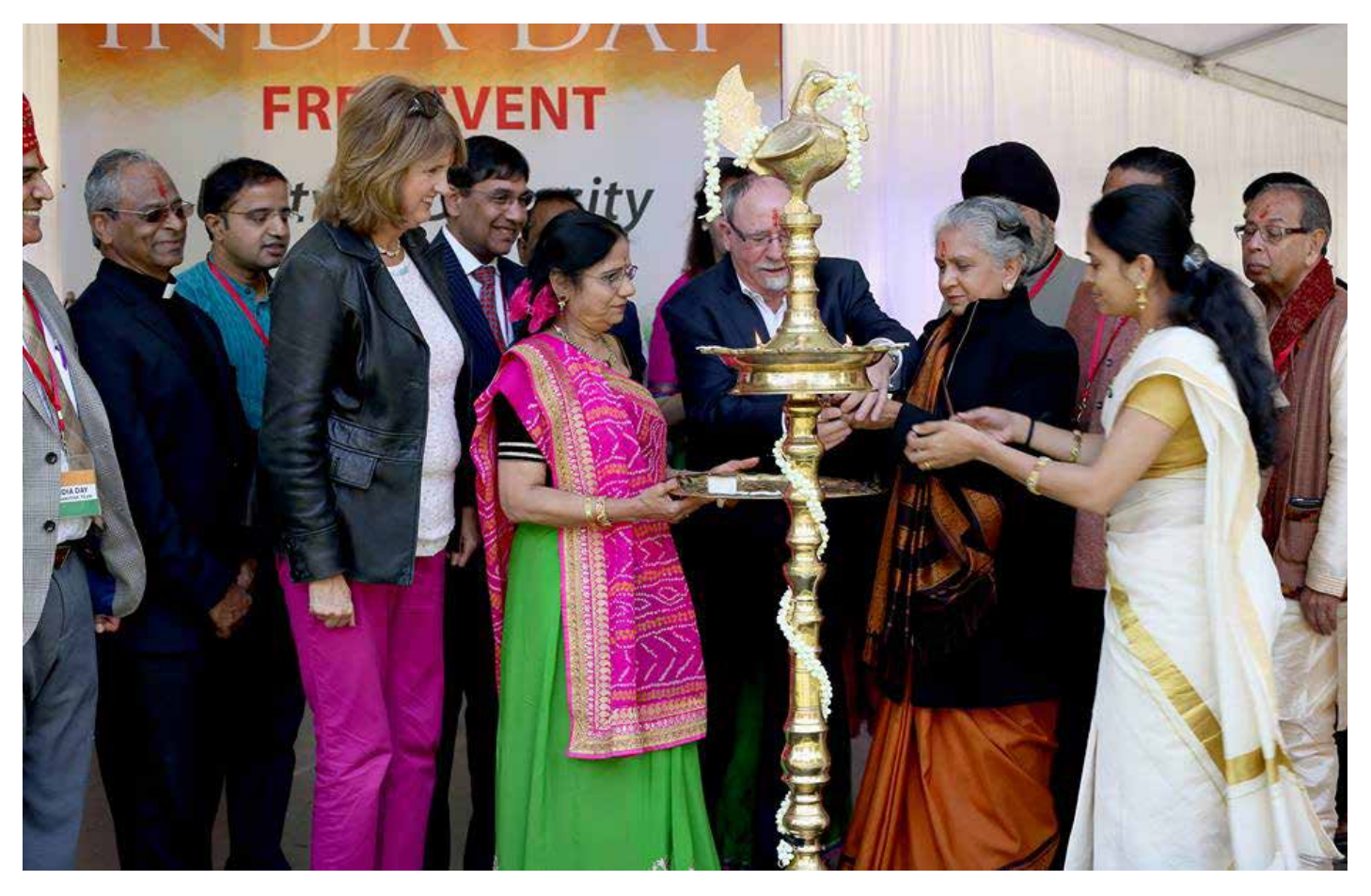
India\ Day\ event\ opening\ ceremony\ with\ traditional\ lamp\ lighting\ by\ Ambassador\ and\ other\ dignitaries.